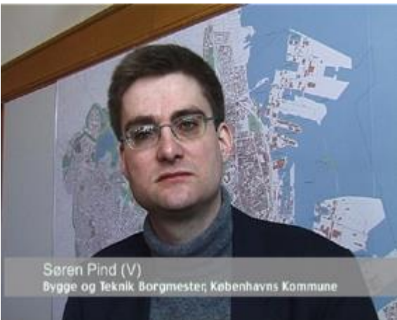
Søren Pind, Mayor of Copenhagen responsible for housing.