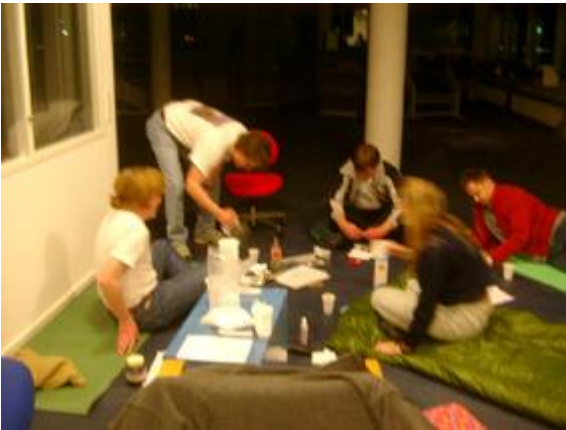
Our first 'scene shooting plan meeting' inside.