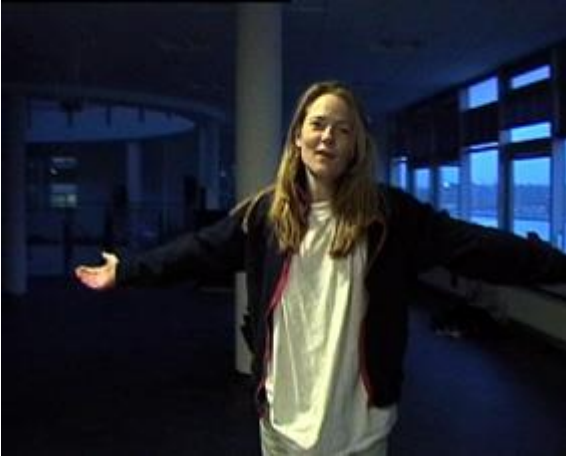
Happy to be inside