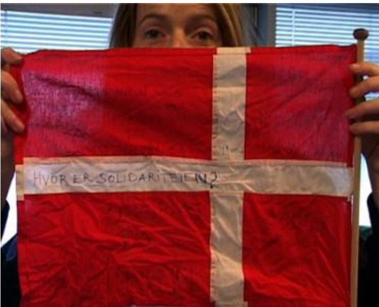
Where is the solidarity?