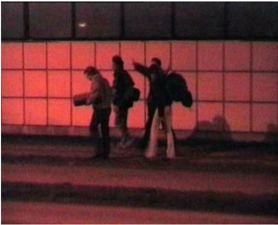
On the street searching for the right office.

The focus is on the way our society prioritise and and how choises that are beneficial in one context increases homelessness.